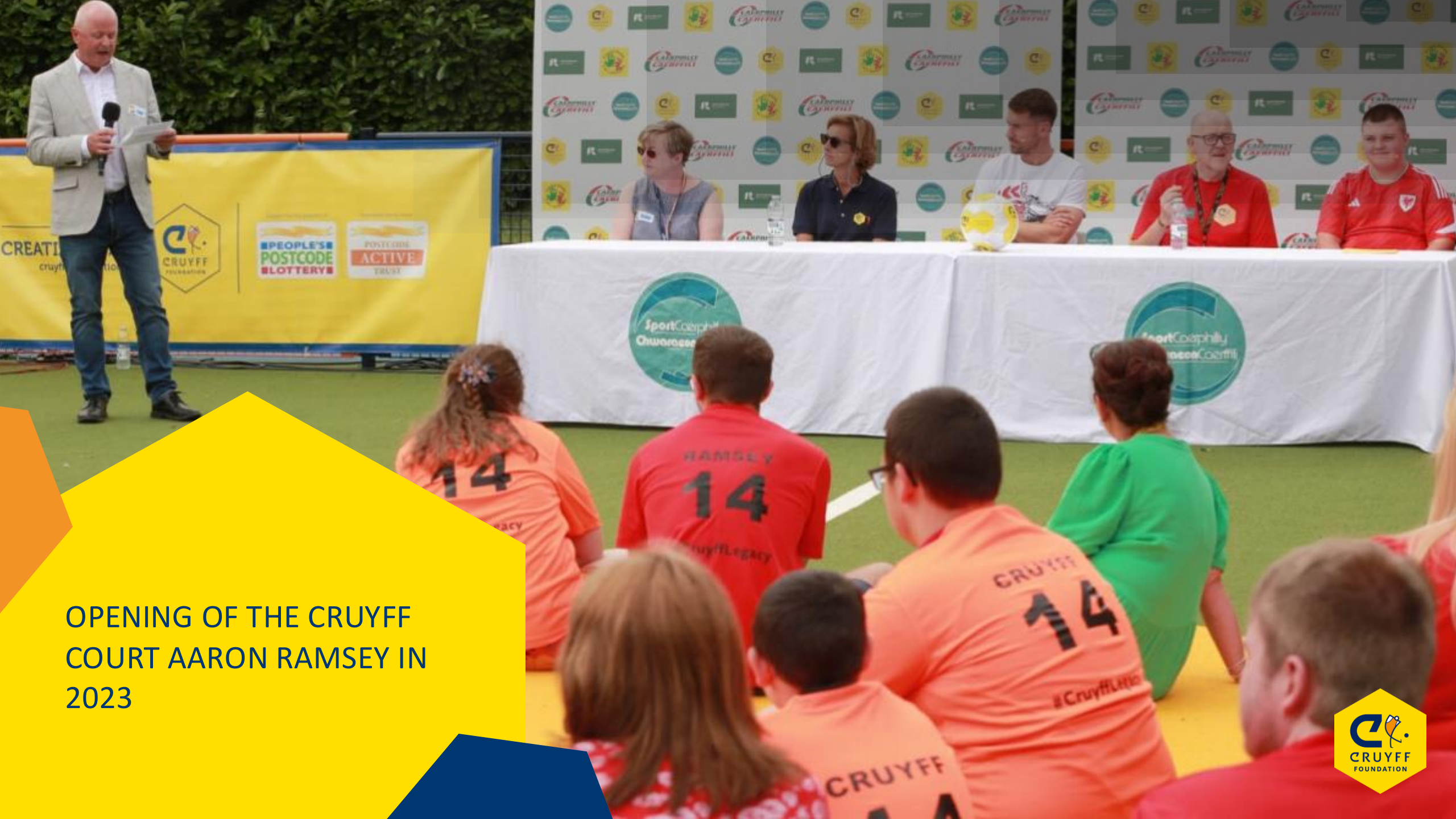
OPENING OF THE CRUYFF COURT AARON RAMSEY IN 2023