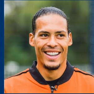
VIRGIL VAN DIJK