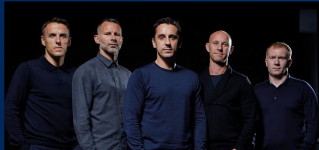
CLASS OF '92